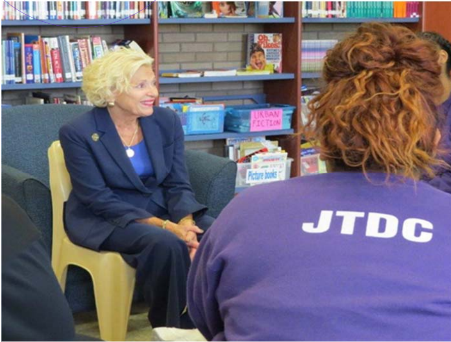
Supreme Court Justice Anne Burke