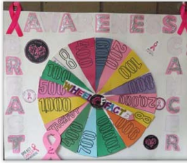
Winning Poster from Pod 5G

Some of our families and co-workers have been touched by this disease and we encourage you to honor those affected.